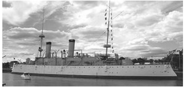
Figure 2 Olympia Pier side at the Independence Seaport Museum in Philadelphia

If no such entity is found, the museum will scrap or scuttle the Olympia .