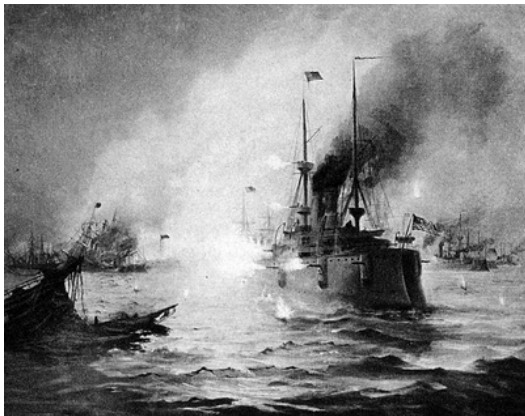
Figure 1 Olympia at Manila Bay

Then: The enemy's guns had opened up on the Admiral's fleet as he steamed towards their line of battle. He held fire conserving his limited ammunition until his range had closed enough to ensure effective fire. At 5:22AM on May 1, 1898 United States Navy fleet Admiral George Dewey spoke into a brass communication tube "You may fire when ready Gridley." With those immortal words, the Olympia and the fleet she led, commenced to decimate the Spanish fleet at Manila Bay. This command, spoken from the bridge of the Olympia , would prove to be the tipping point in the United States' emergence as a world power and set in motion our longstanding relationship with the people of the Philippines.